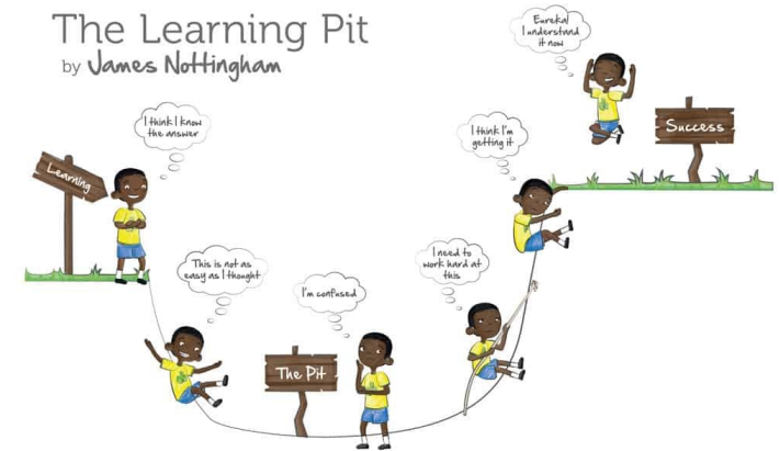
Challenge and high expectation