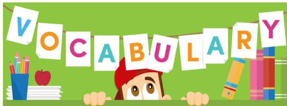
Subject knowledge and vocabulary